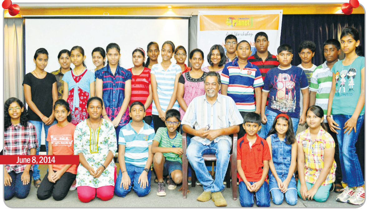
June 8, 2014

Teaching 12 to 16-year-old participants learn to appreciate art in all forms and express themselves through art