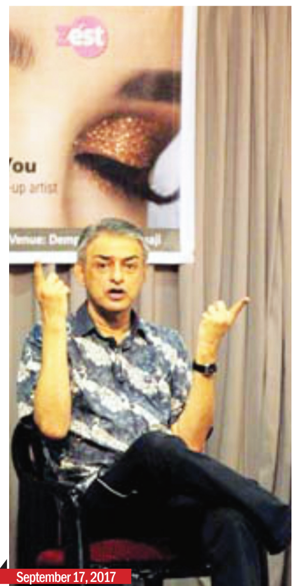
September 17, 2017

Giving participants tips on different types of make-up and the do's and don'ts of grooming