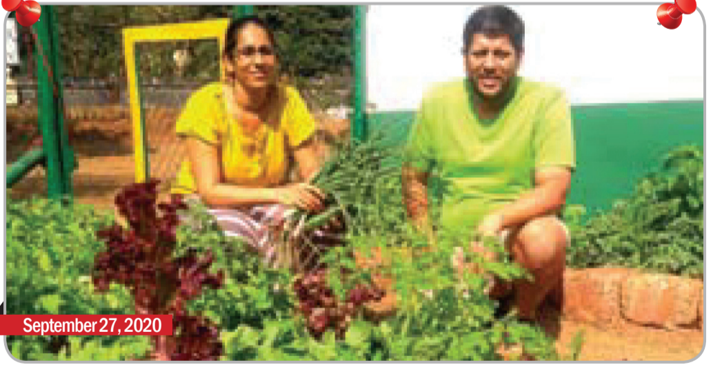
September 27, 2020

Helping participants understand the importance of organic produce and how to grow fruits and veggies organically at home Aired on Goa365