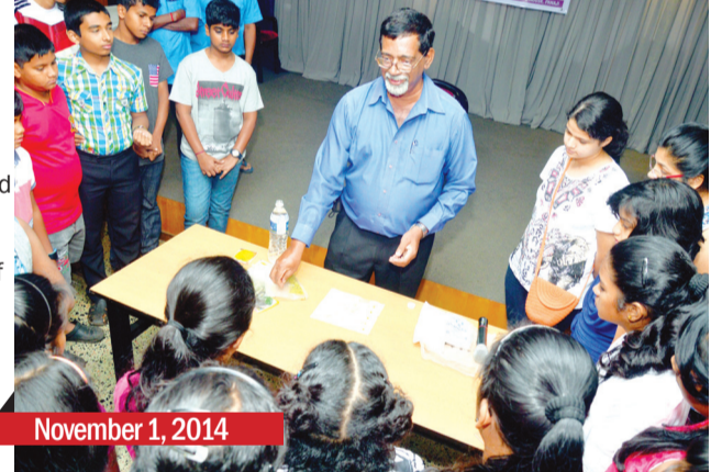
November 1, 2014

Teaching 12 to 16-year-old participants pot cultivation of vegetables and flowers