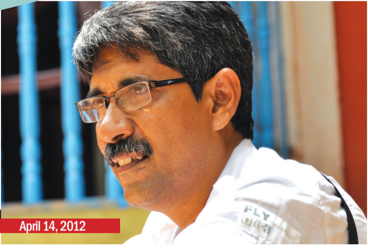
April 14, 2012

Sharing his knowledge of some heritage sites visited in and around Panaji so that the 12 to 15-year-old participants learn the history behind them