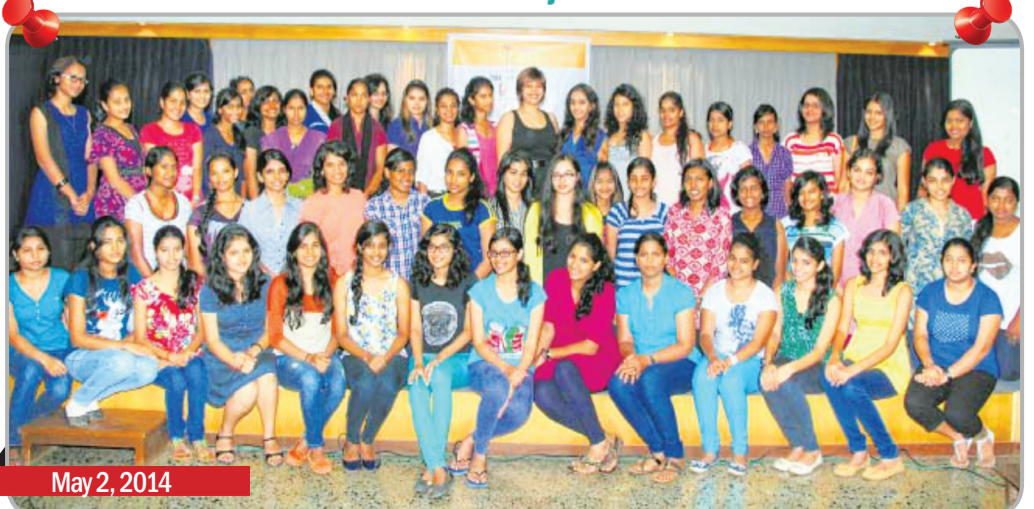
May 2, 2014

Helping participants understand the importance of a good hair cut, choosing the right cut and general hair care along with basics of make-up