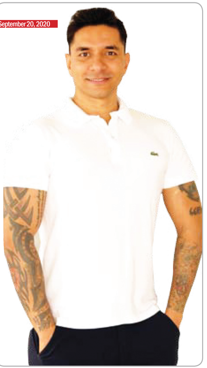
September 20, 2020

Understanding the cause of chronic illnesses and how to overcome/manage the same with the right foods, lifestyle and other holistic natural practices Aired on Goa365