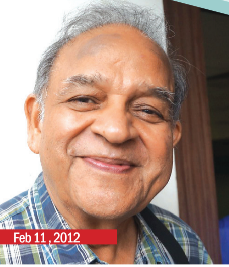
Feb 11, 2012