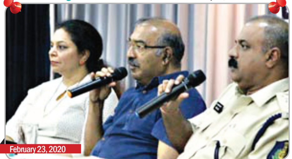
February 23, 2020 Highlighting a career in the police force to the 12 years and above participants and helping them understand the various aspects of the profession