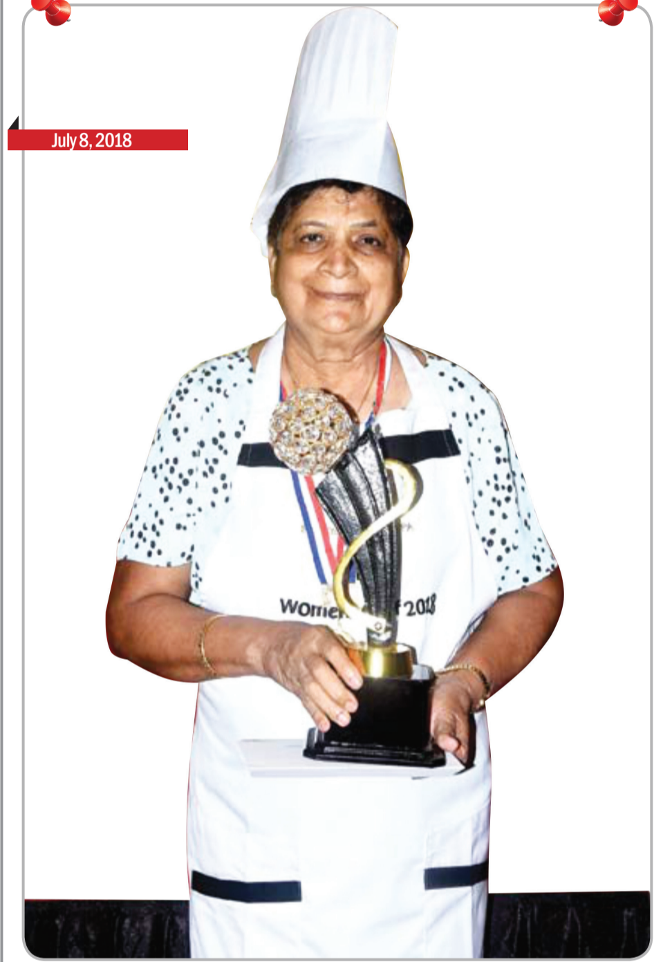
July 8, 2018

Appreciating gastronomic talents of Goan ladies while inculcating a spirit of healthy competition and a passion for creativity. Also, promoting culinary passion, taste for excellence and bringing to the fore some traditional recipes that have been handed down through generations