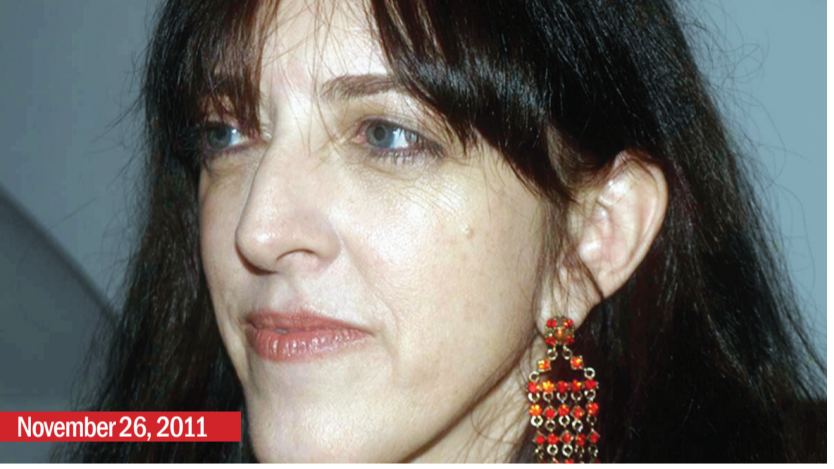
November 26, 2011 Helping 12 to 15-year old students explore the relationship between text and image with a focus on personal essay and flash fiction