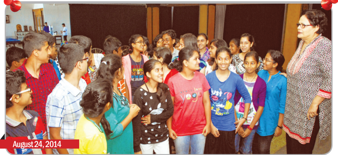
August 24, 2014

Helping 14 to 16-year-old participants write successfully using inspiration, imagination and mechanics (good grammar, spelling and syntax).