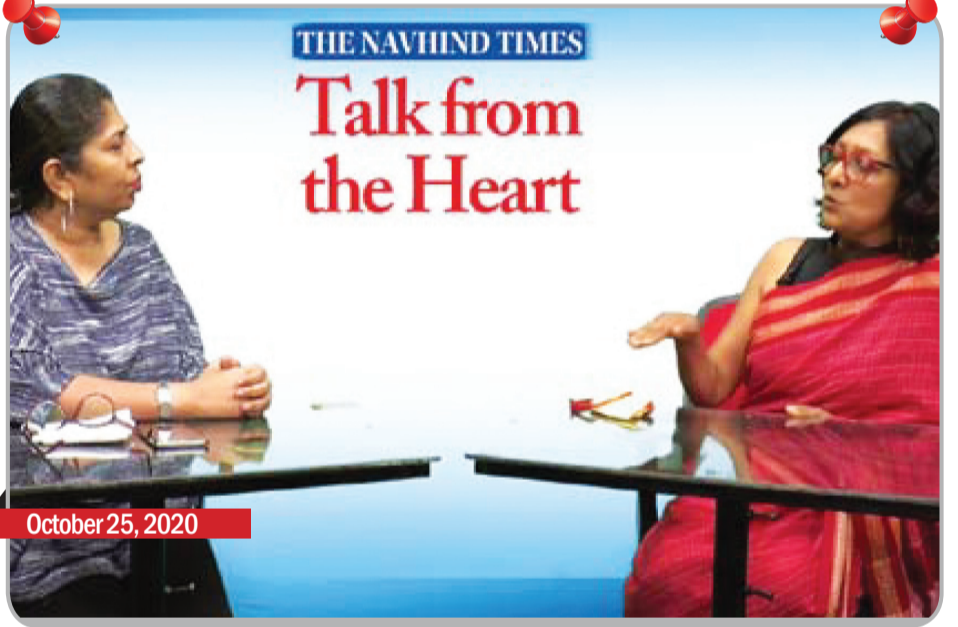
October 25, 2020

Area of expertise - Allergies and clinical immunology Demystifying the different types of allergies, its causes and treatment Aired on Goa365