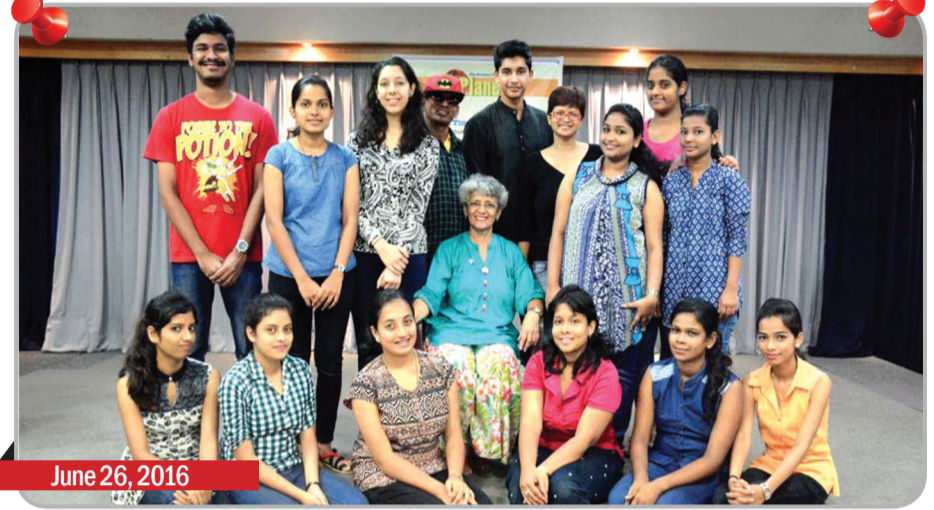
June 26, 2016 Area of expertise - Drama/theatre Familiarising 13 to 19 year olds with theatre as a form of art and introducing the participants to the basics, with special emphasis on the role of creative imagination, collaborative processes and effective communication